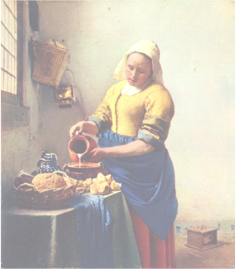
The Milkmaid by Johannes Vermeer, 1658-1660, Rijksmuseum, Amsterdam