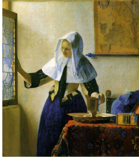
Young Woman with a Water Pitcher by Johannes Vermeer, 1662-1663, Metropolitan Museum of Art, New York